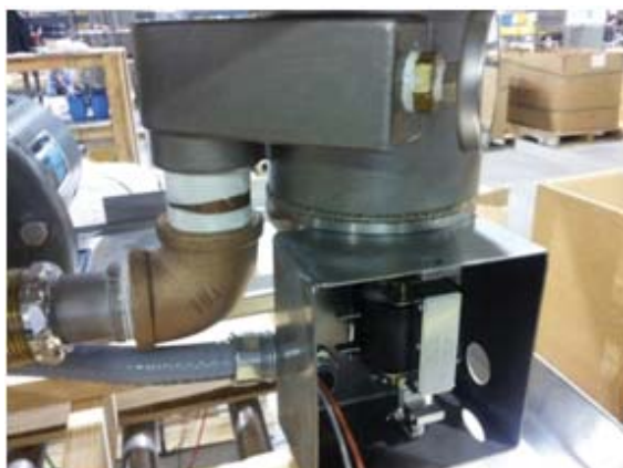
Showing drain solenoid