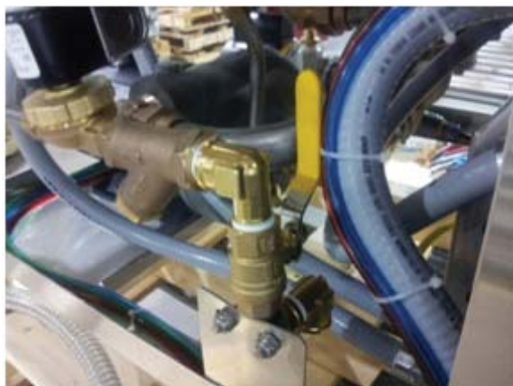
Showing ½" female pipe inlet, ball valve, y-line filter, H2O solenoid

#3 DRAIN SIZE —The gravity drain model uses 1.5" female pipe to exit the sump.