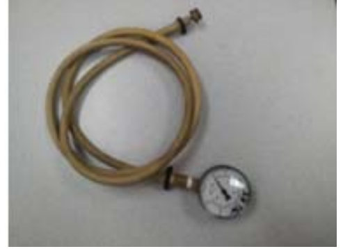
Spray arm pressure tester #088-1048

To widen the notch (length = time energized) or close the notch use the timer adjustment tool, which is provided and taped to the control box shelf. This tool has two raised buttons that fit into the holes on the side of each wheel. The factory sets the start of each function using the right-side wheel of the cam. TO ADJUST rotate only the left-side cam wheel. The left-side of the wheel controls the point when that specific functions ends. Factory settings are only initial settings, adjustments will be required for each chemical and the water fill time because water pressures will be different for every account.