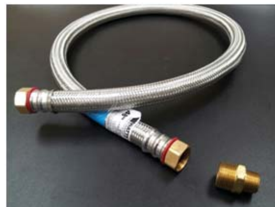
OPTIONAL 48" hot water inlet flex hose and adapter (088-1068)