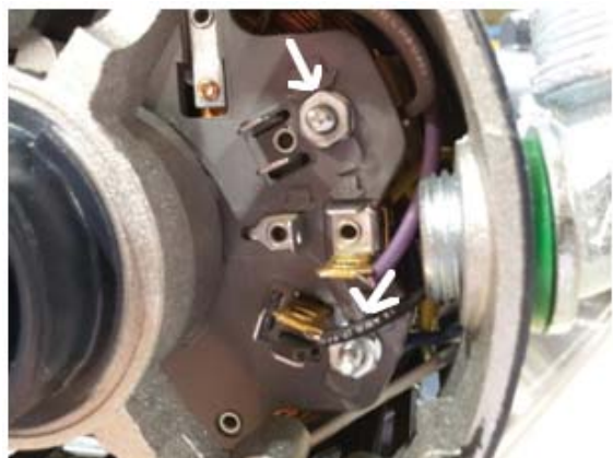
1.5 HP Motor, arrow 1 arrow 2 point to L1 and Neutral connect points

IT IS RECOMMENDED THAT THIS EQUIPMENT BE INSTALLED USING A NEW CIRCUIT BREAKER.