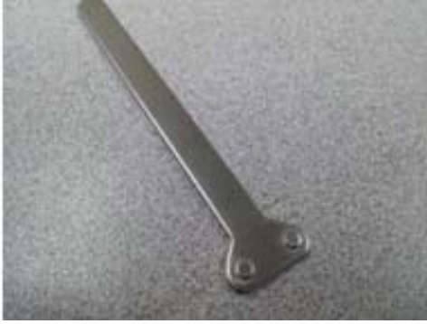
Cam timer adjustment tool