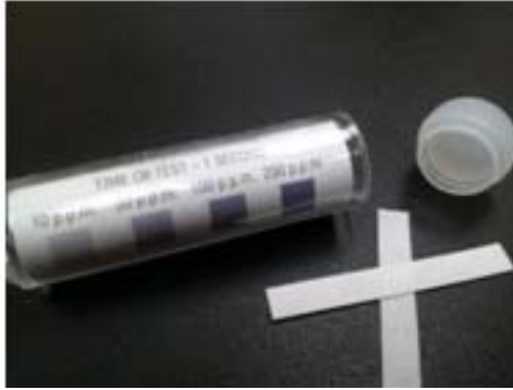
Chlorine test strips