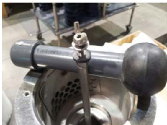
ET (gravity) drain ball, note rubber washer on push rod