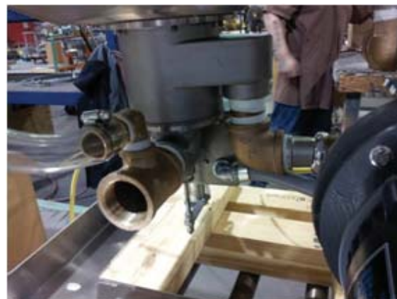
Drain outlet, 1.5" pipe