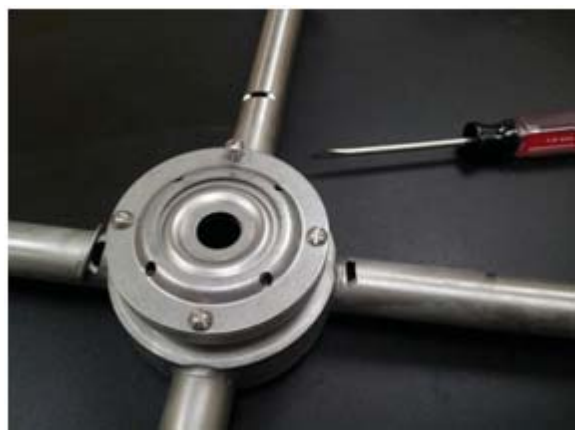
Remove 4 screws and lift top shell