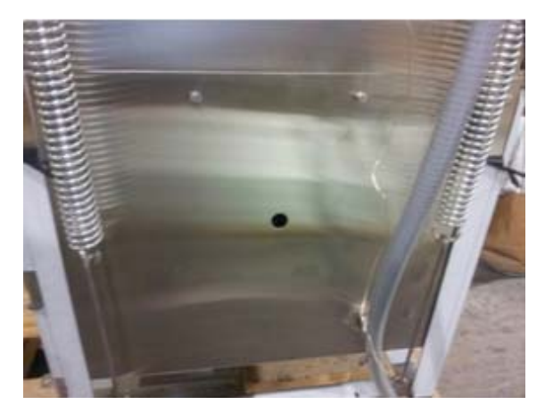
Showing back of tank, 7/8" detergent bulkhead fitting hole

ADS provides two (2) ports, 1/8" IPS female threads in the final rinse mixing chamber for dispenser check valves. Probe hole (7/8") is provided in the wash tank for probe installations (install probe before operating the machine). Detergent hole (7/8") is provided for bulk-head fitting (install fitting before operating machine).