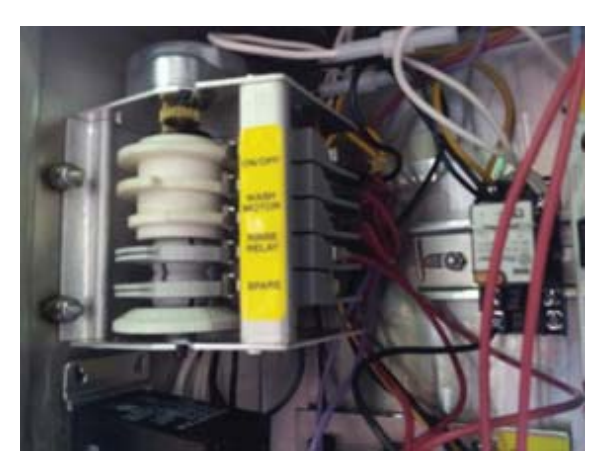
Cam timer with 3 fixed operational cams, 2 adjustable