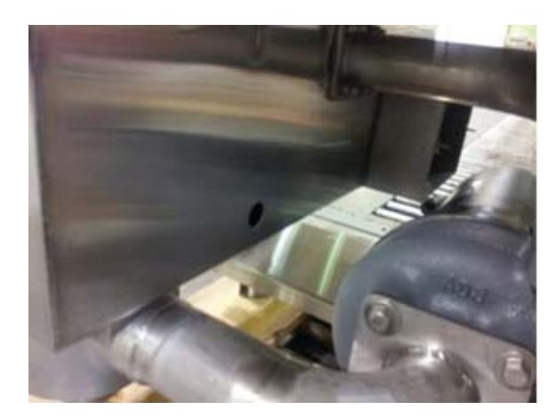
Showing 7/8" detergent probe hole behind pump motor

ADS provides two (2) ports, 1/8" IPS female threads in the final rinse mixing chamber for dispenser check valves. Probe hole (7/8") is provided in the wash tank for probe installations (install probe before operating the machine). Detergent hole (7/8") is provided for bulk-head fitting (install fitting before operating machine).