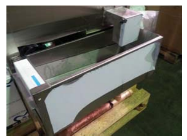
Scrap box and 2"drain manifold attached to pallet for shipping

ADS provides a 2" copper drain manifold for the tank and scrap box, the manifold is shipped strapped to the pallet of the dishmachine. After installation, attach the drain manifold using the rubber "no-hubs" on the manifold. To prevent clogging, run drain lines as straight as possible. Do not plumb with tight radius elbows or 180° bends. Use of floor sinks for drains can cause flooding. Do not use reducing adapters for drain lines, always use 2" diameter pipe or larger. Always run gravity drain lines downhill.