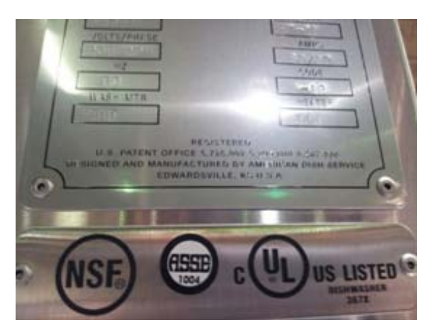
Data plate information and listing marks