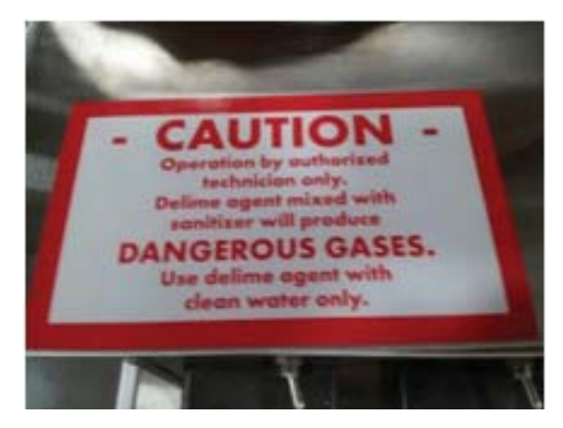
Warning decal about mixing chemicals