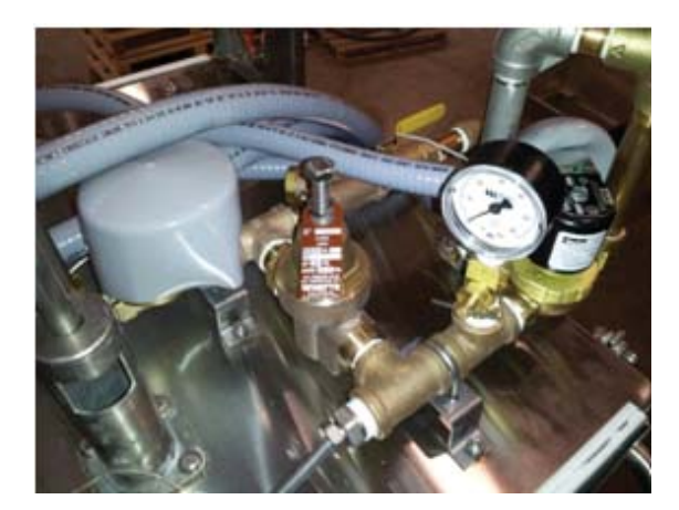
Showing PRV, ASSE approved air-gap, final rinse gauge

Flush the building's water lines before connecting to the dishmachine to avoid fouling the inlet water solenoid. For high temp sanitizing this inlet water line must come from a stand-alone booster heater. Connect ¾" MPT water supply line to a 12kW booster and a ½" MPT line to the top of the dishmachine inlet manifold when using a stand-alone booster. The requirement at the dishmachine is 180°F minimum at 20 PSI during final rinse, with a demand of 47.2 GPH. The pressure is measured at the pressure gauge mounted next to the pressure reducing valve in the inlet plumbing on top of the machine's hood. To adjust pressure, turn adjustment screw atop the valve counter-clockwise to decrease pressure.