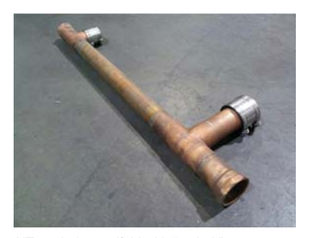
HT-25 drain manifold with "no-hub" connectors