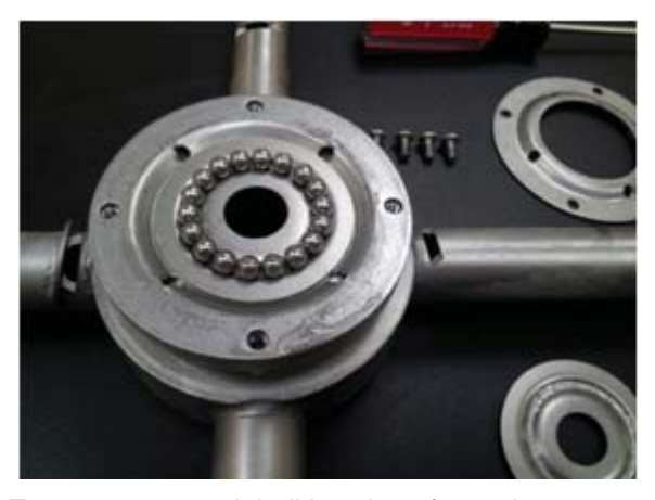
Top race removed, ball bearings for replacement