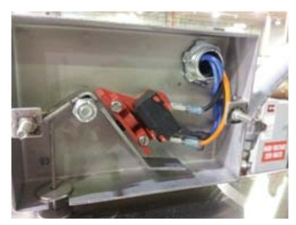
Showing "float" switch that controls fill water & heater

The wash temperature is maintained by a sustainer heater. Record tank temperature during the initial tests. There are two gauges mounted under the control box. Gauges are marked Wash/Final Rinse. Wash tank temperature should be 140°F for chemical sanitizing and 160°F for hot water sanitizing. If tank temperatures are low, increase by adjusting the heater thermostat located behind the wash motor.*