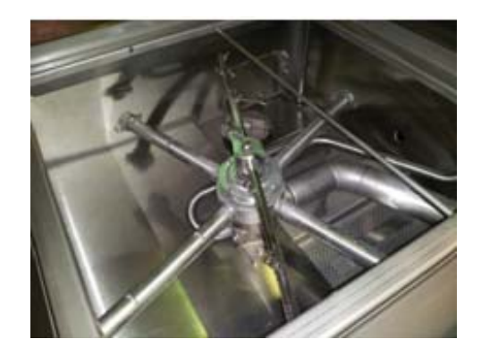
Showing spray arm base & transfer tube