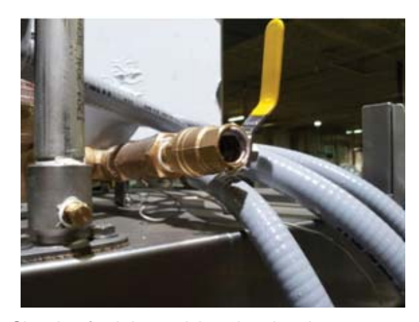
Showing final rinse mixing chamber, hot-water inlet to HT-25

#6 HOODS—Follow all local plumbing and mechanical codes. IMC 2012, section 507.2.2 requires Type II hoods for all commercial dishwashers except where the heat and moisture loads are incorporated into the building's HVAC systems or dishwashing equipment designed with separate heat and moisture removal systems. A door-type, single-rack, hot-water sanitizing dishwasher is rated at 4770 Btu/h by table 5E, ASHRAE Research Project #1362, 8/5/2008. ADS DOES NOT SPECIFY BUILDING HVAC VALUES.