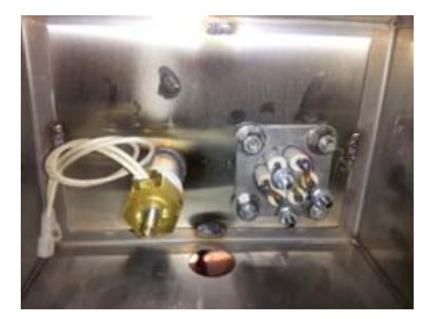
Showing thermostat and sustainer heater terminals*

To operate, connect the breaker for main power and turn "ON" the dishmachine master switch. Water will automatically fill to an operational level. After several cycles when final rinse water increases the tank water level, the tank water will overflow to the scrap box. Place a rack of dishes in the machine, close the door and the cycle will begin.