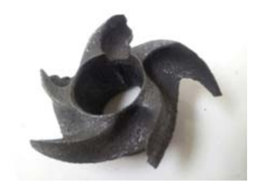
Impeller damaged from high acid solution