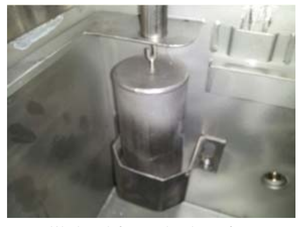
Wash tank float and tank overflow

"FLOAT" AND SWITCH—the float will not actually float. It is heavier than water but it weighs less in water than in air. This difference allows the return spring in the float switch to push out against the lever, which raises the float in water. In air the float weight will overcome the switch spring tension and drop down. The float switch (#291-3014) is specifically made with this spring tension so the water control system will operate correctly. Do not replace with a timer switch even though they look the similar.