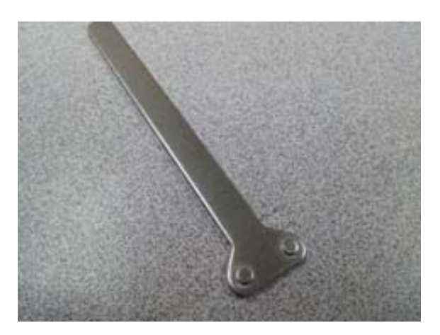
Cam adjusting tool

TESTING FOR TEMPERATURE—For high temp sanitizing, the measurement is taken at the manifold for a minimum of 180°F, NOT in or at the sprays. If tapes are used to verify temperature, then only 165°F labels should be used, this is the temperature required on the surface of the plates--NOT 180°F. This is according to the NSF/ANSI Standard 3 test protocol.