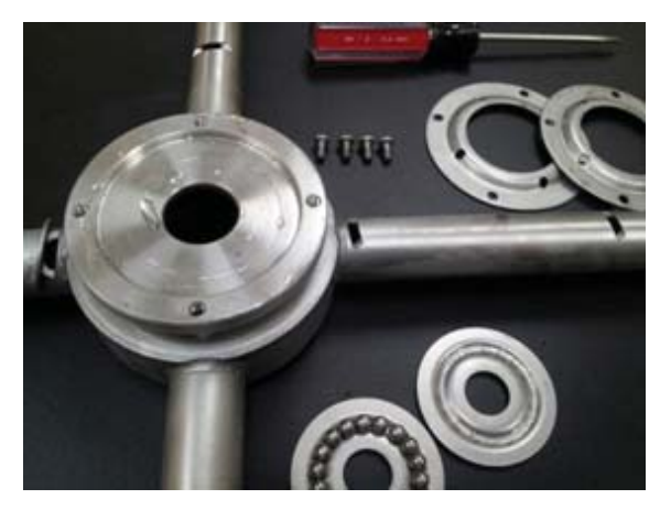
Races are interchangeable, capture shells are also

Showing repair of loose end cap when tab on the cap has been forced close or bent on material such as seeds or tooth picks.