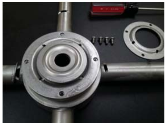
Remove top shell, exposing top bearing race