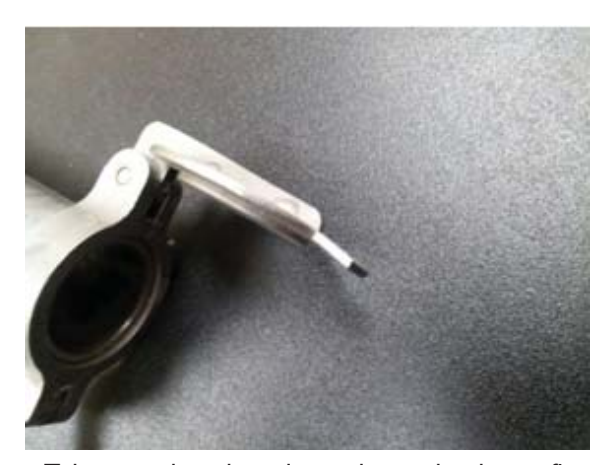
Tab on endcap bent inward, causing loose fit

Showing repair of loose end cap when tab on the cap has been forced close or bent on material such as seeds or tooth picks.