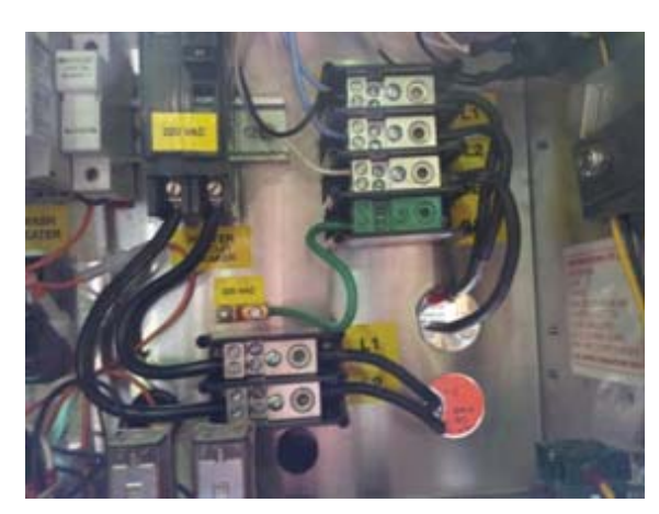
Main distribution blocks for two incoming circuits, 30/60a