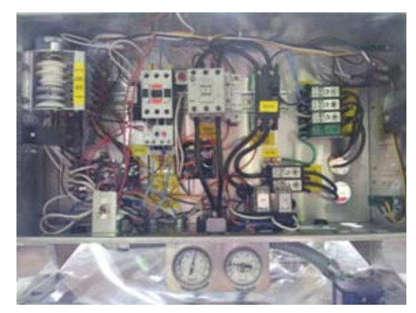
Showing HT-25, single-phase control box

Before powering up the machine, CHECK ALL ELECTRICAL SCREW TERMINALS in the control box on top of the machine and the heater box. Screws can loosen in transit. Loose connections on high amp load terminals will cause wire burning and component damage during operation and will not be covered under ADS warranty. The term "Clean Circuit" means the electrical circuit breaker supplies no other devices, motors, machines, or lights.