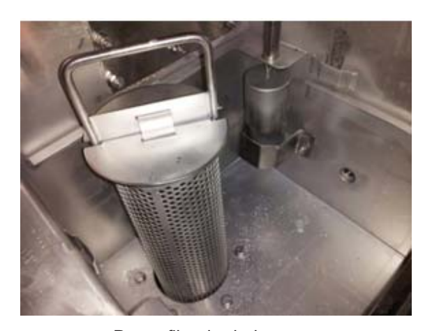
Pump filter in drain sump