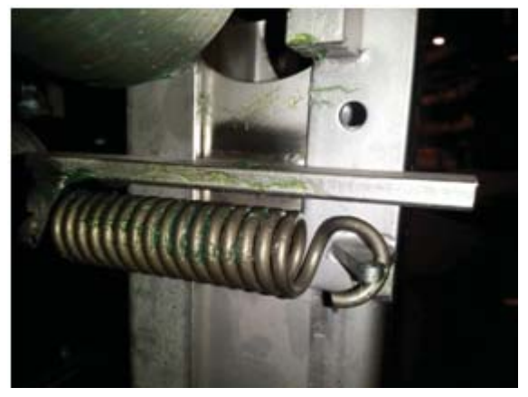
Rocker arm slip clutch spring, hook to bar weldment