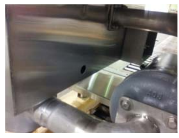
Showing 7/8" detergent probe hole behind pump motor

ADS provides two (2) ports, 1/8" IPS female threads in the final rinse mixing chamber for dispenser check valves. Probe hole (7/8") is provided in the wash tank for probe installations (install probe before operating the machine). Detergent hole (7/8") is provided for bulk-head fitting (install fitting before operating machine).