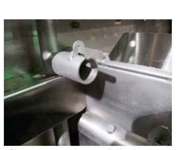
Showing pumped rinse manifold locking tab