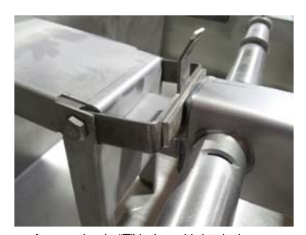
Arm resting in "T" index with latch down