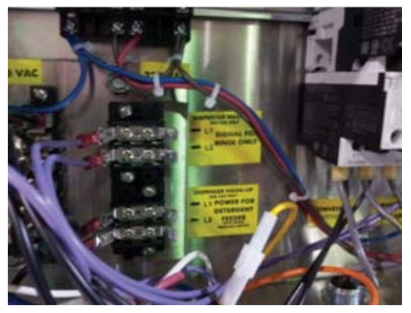
Dispenser signal connection terminals in control box

NOTE: Before turning on the water, if the chemical dispenser has not been installed, plug the probe and chemical delivery holes in the wash tank and plug the mixing chamber injection ports. ADC-44, 3-phase provides 240v dispenser signals (transformer control voltage).