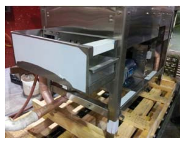
Scrap box and tray

ADS provides a 2" copper common drain that exits on the soil side of the dishmachine under the scrap box (ADC-66 drain exits both sides). To prevent clogging, run drain lines as straight as possible. Do not plumb with tight radius elbows or 180° bends. Use of floor sinks for drains can cause flooding. Do not use reducing adapters for drain lines, always use 2" diameter pipe or larger. Always run gravity drain lines downhill.