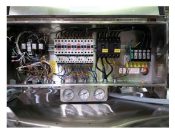
ADC-66 conveyor control box for 3-phase power

3-Phase MOTOR ROTATION—Remove front panels and check rotation of motors. A rotational arrow is placed on the wash pump motor. If this motor is running in reverse of the arrow, turn off main power and switch the incoming power wires on L1 & L2. This step will correct the rotation of the other motors at the same time. Verify proper rotation and tighten all wires.