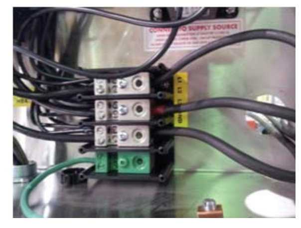
Main distribution block for 44's incoming 3-phase