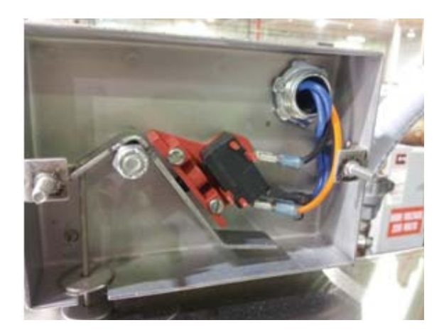
Showing "float" switch that controls fill water & heater

To operate, turn on the breaker for main power and turn the dishmachine master switch to the "ON" position.