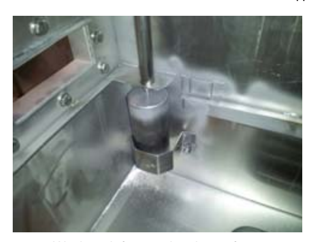
Wash tank float and tank overflow

"FLOAT" AND SWITCH—the float will not actually float. It is heavier than water but it weighs less in water than in air. This difference allows the return spring in the float switch to push out against the lever, which raises the float in the water. In air the float's weight will overcome the switch's spring tension and drop down. The float switch (#291-3014) is specifically made with this spring tension so the water control system will operate correctly. Do not replace with a timer switch even though they look similar.