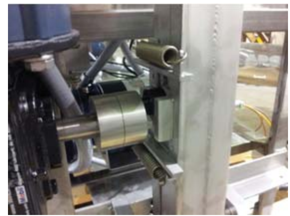
Conveyor drive, cam blocks, bearing, clutch springs (use caution)