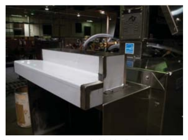
Vent attachments to end shield, 4" x 16" opening

INSTALL CURTAINS— There are two short and two long curtains. Longer curtains are mounted at each end of the dishmachine. Curtains are there to keep heat in the water.