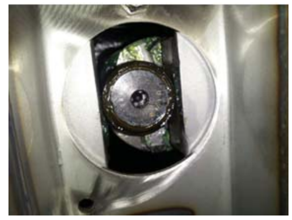
Cam bearing screws into cam block B