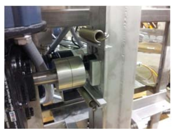
Conveyor cam blocks A & B