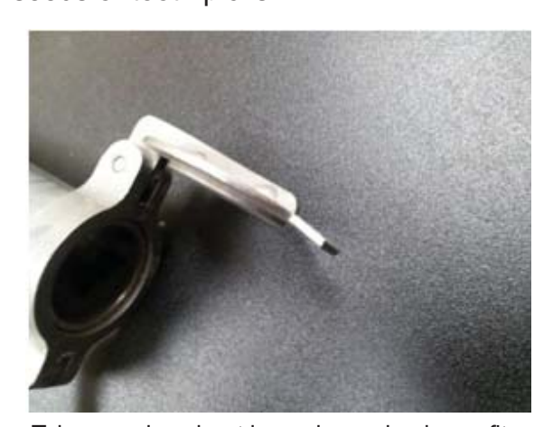
Tab on endcap bent inward, causing loose fit

Showing repair of loose end cap when tab on the cap has been forced close or bent on material such as seeds or tooth picks.