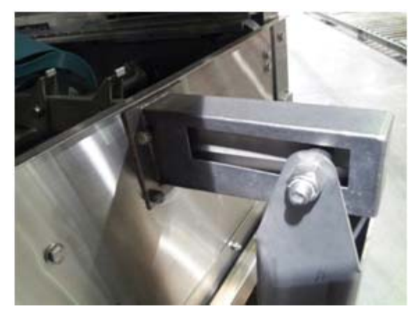
Rocker arm attached to conveyor bar, drip chute