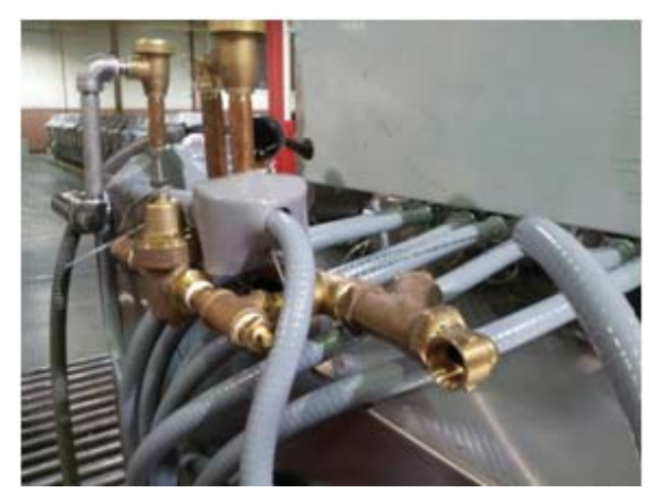
Hot water inlet manifold, single point ¾" pipe, PR valve

#6 HOODS—Follow all local plumbing and mechanical codes. IMC 2012, section 507.2.2 requires Type II hoods for all commercial dishwashers except where the heat and moisture loads are incorporated into the building's HVAC systems or dishwashing equipment designed with separate heat and moisture removal systems. A conveyor-type, hot-water sanitizing dishwasher is rated at 21,720 Btu/h by table 5E, ASHRAE Research Project #1362, 8/5/2008. ADS DOES NOT SPECIFY BUILDING HVAC VALUES.