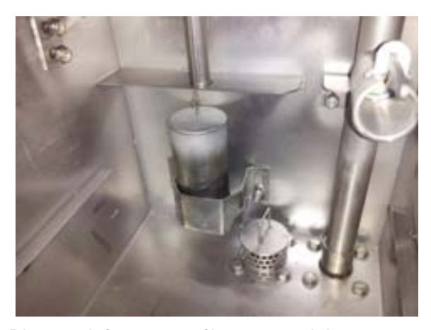
Rinse tank float, pump filter, pumped rinse manifold