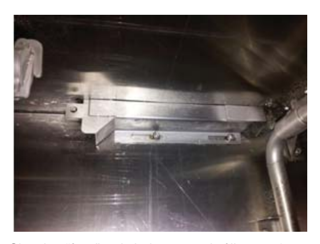
Showing "float" switch that controls fill water & heater

FILLING THE MACHINE— When the machine is first turned on, water will automatically fill to an initial working level. During operation the water level will normally increase with each rack until water begins to exit the overflow into the scrap box. Open the access door and verify that the filling water is adjusted so the wash tank fills first and rinse tank fills last. For the ADC-66 the wash tank must overflow to fill the power scrapper tank. The last tank to fill should be the pumped rinse tank. If the fill sequence does not follow this order, adjust the diverter plate inside the hood, it is located upward near the water inlet (see photo above). Slotted holes allow the diverter plate to move side to side adjusting the flow to the rinse tank. The water stream going into the pumped rinse tank should be about the diameter of a pencil. It is normal for the machine to add more water when the pump turns on if the level has not yet reached the overflow.