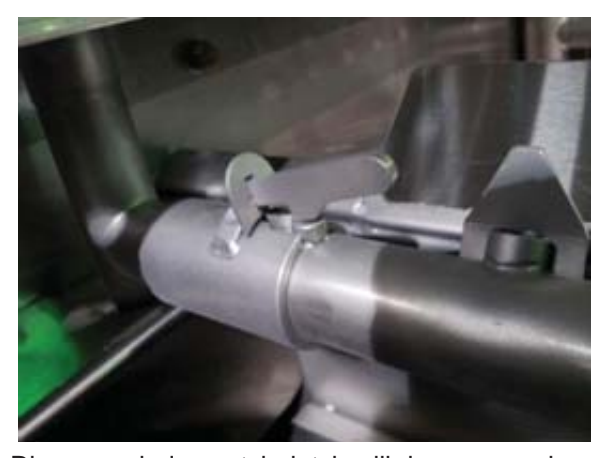
Rinse arm index notch, latch will drop as arm is pushed in