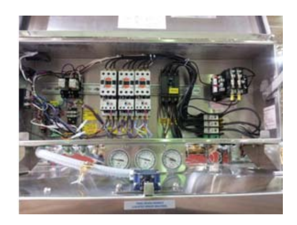
ADC-44 conveyor control box for 3-phase power

#2 ADS Conveyor models DO NOT INCLUDE an internal booster heater. Boosters must be installed separately, ADS recommends a 27 kW for 155 GPH at a 70°rise.