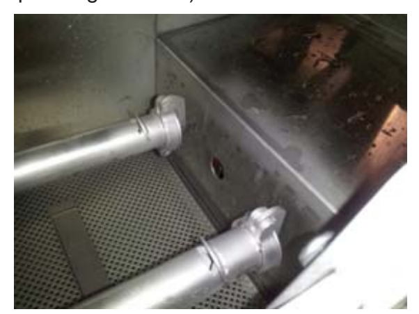
Showing hole at the side of tank, 7/8" detergent fitting

ADS provides two (2) ports, 1/8" IPS female threads in the final rinse mixing chamber for dispenser check valves. Probe hole (7/8") is provided in the wash tank for probe installations (install probe before operating the machine). Detergent hole (7/8") is provided for bulk-head fitting (install fitting before operating machine).