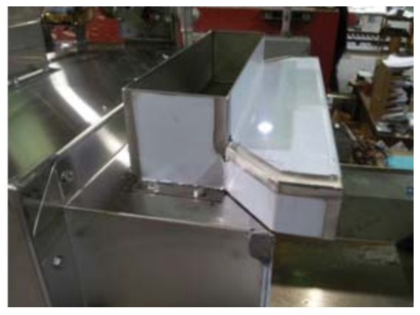
200 to 400 CFM draw per side

VENTING—If exhaust vents (pant-leg vents) are attached to the dishmachine, do not exceed 400 CFM per individual pant leg. ADS does not specify building HVAC values and only offers this limit as a point of reference.