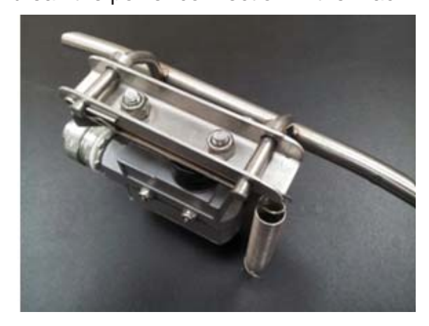
ADS table limit, and table bumper bar (#288-1044)

TABLE LIMIT SWITCH—Check clean dish table, if it holds less than four (4) dish racks, install an ADS table limit switch (#288-1044). The switch holder attaches to the back side of the table end. The bumper bar will extend through the table and pin to the rocker plate. When racks strike the bar, the switch will break the power connection in the machine's door cut-off switch, which stops all motors.