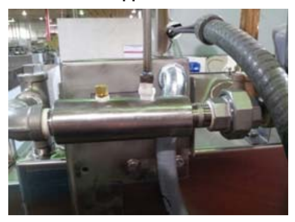
Mixing chamber with two 1/8" pipe threaded ports Hi-temp mixing chamber is SS, Chemical is a polymer

There is NO CHEMICAL DISPENSER included with this model. Chemical dispensers must be provided and installed prior to operation. The installation of the dispenser is typically provided by the chemical supplier.