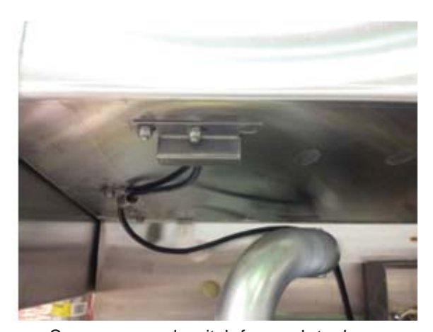
Sequence reed switch for wash tank

FINAL RINSE SECTION – The last sequence bar will control the final rinse and pumped rinse. The pumped rinse, which is called the water curtain, should begin when a dishrack contacts the bar. This is a low pressure spray and the lower spray should only rise 4-6" from the arm. After a six second delay, the final rinse will begin to spray. All functions should stop when the dishrack exits the machine unless there is another rack still inside.