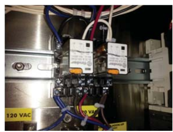
Conveyor motor control relays