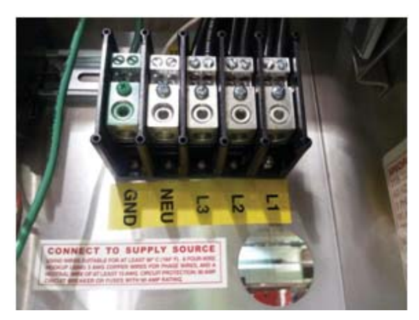
Main distribution block for 66's incoming 3-ph, note Neutral