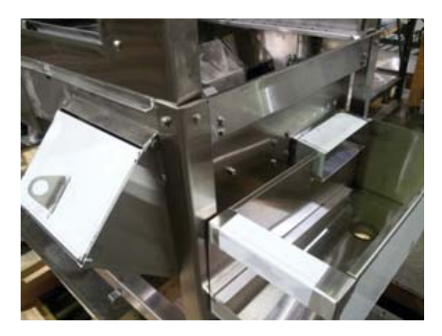
ADC-66 power scrapper, overflow to scrap box

Install wash and pumped rinse spray arms. Lower wash arm has eight spray tubes and upper wash arm has four. Install each by inserting indexed "T" end into bracket at front of tank, and then push the arm back until the round socket is fully inserted on the wash manifold near the back wall. Position the "T" bracket latch to secure wash arms in place by pulling down. Install power scrapper arms (ADC-66 only) and pumped rinse spray arms. Each arm has a locking tab. Lower arm locking tabs are located on the same side as the spray jets. Upper arm locking tabs are opposite the spray jets side. Insert the tab into the index slot of each manifold socket until socket catch locks in place. Note: make sure that spray jets on the bottom arms spray up, and top arms spray down.