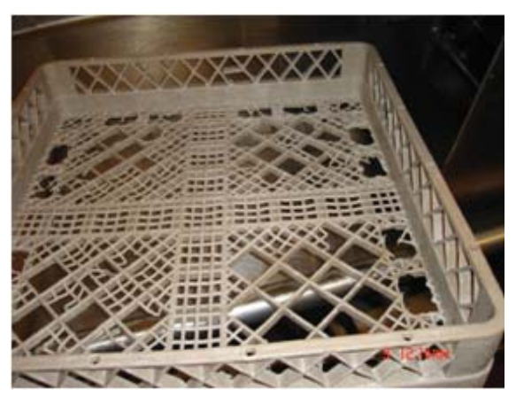
Damaged and broken rack that will jam or skip conveyor

TEST DISH RACK CONVEYOR MOVEMENT by placing a rack into the soil side opening until it catches on a conveyor dog. The rack should enter and exit smoothly without jamming. The dishmachine tray track will not adjust up or down, it is fixed. Tables must sit on the tank lip. Verify that tables are bolted to the machine, and once bolted, sealed with silicone caulking at all four corners and under the lip. Check that all varieties and brands of dishrack can fit between the dishmachine's tray track rails without binding. If binding occurs, adjust the REAR tray track at all (3) anchor points until the rack binding is eliminated. You must adjust evenly at all three points to maintain proper alignment. Never adjust the front tray track, they contain switching alignments.