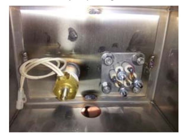
Wash tank thermostat, rotate center rod Left to increase

TANK TEMPERATURE—The wash and pumped rinse tank temperatures are maintained by sustainer heaters. Record tank temperatures during the initial tests. There are three (3) gauges mounted under the control box. Gauges are marked Wash/Rinse/Final Rinse. Wash tank temperature should be 140°F for chemical sanitizing and 150°F for hot water sanitizing in multi-tank conveyors. The pumped rinse tank temperature should be 120°F for chemical and 160°F for hot water sanitizing. If tank temperatures are low, increase by adjusting the heater thermostats located behind the front panels.