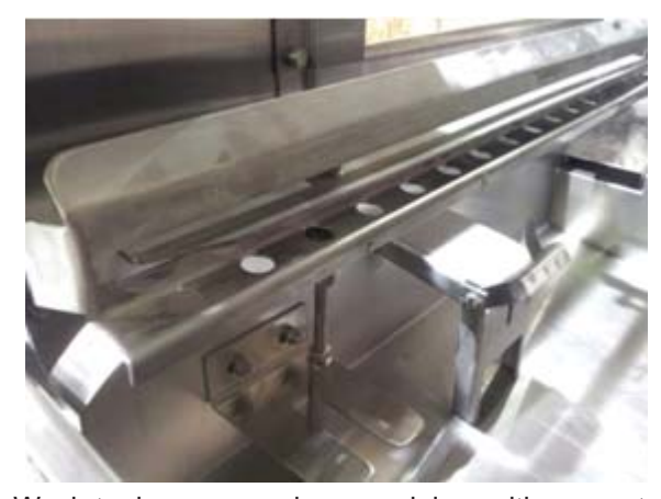
Wash tank sequence bar, pendulum with magnet

SEQUENCE BAR MAGNETS— The magnets located on the pendulum sequence bars inside the tank activate the reed switches, which are manufactured in the normally closed position (always on). The reed switch is mounted to the outside of the tank and turns off when a magnet comes within ½" of the switch. To test, hold a strong hand-held magnet next to the reed switch. If the magnet turns off the reed switch but the sequence bar magnet does not, adjust the sequence bar magnet for that section. The sequence bar magnet should be within a 1/8" of the bottom of the tank when it is at rest (hanging down at the 6:00 position).