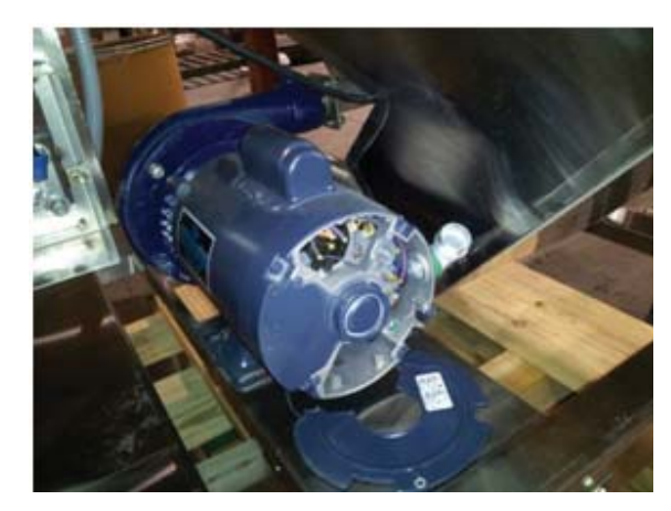
66 power scrapper motor, 1.5 HP, 208v, single-phase

Inspect all dish racks for broken ladders. Dispose of any broken dish racks.