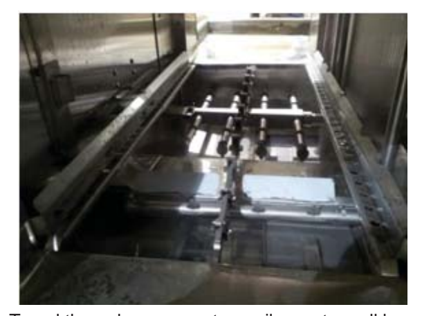
Travel through conveyor tray rails, center pull bar w/dogs

"FLOAT" AND SWITCH—the float will not actually float. It is heavier than water but it weighs less in water than in air. This difference allows the return spring in the float switch to push out against the lever, which raises the float in the water. In air the float's weight will overcome the switch's spring tension and drop down. The float switch (#291-3014) is specifically made with this spring tension so the water control system will operate correctly. Do not replace with a timer switch even though they look similar.