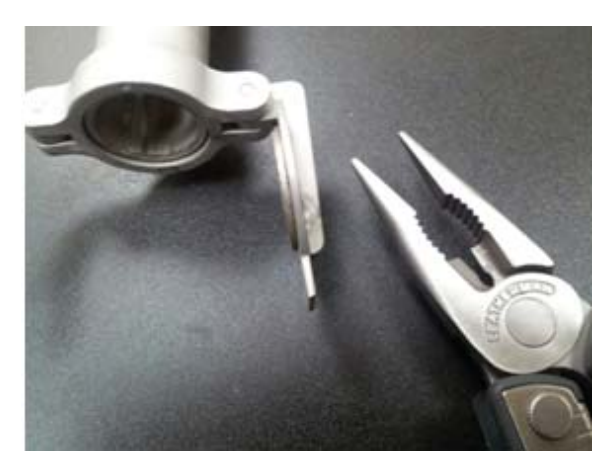
Straighten tab in line with the coin edge to tighten latch