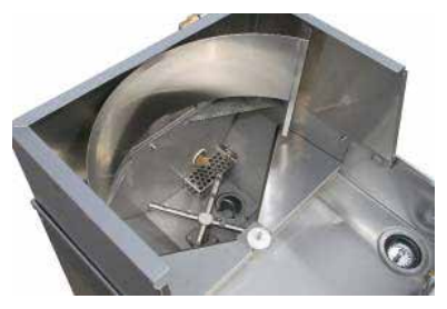
Glassware crossarm with standard spray arm bearing and bayonet pin