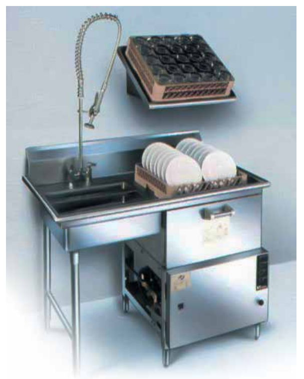
Need a free standing warewashing center in only 48" of space? Combine our ET-AF under-counter with our stainless steel table package.