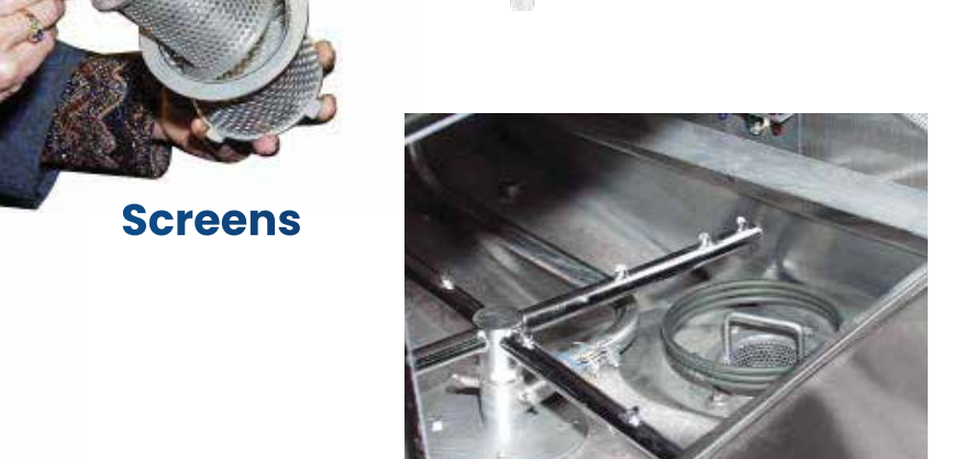
Optional Heat Maintains tank temperature