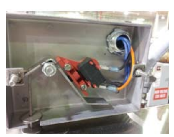
Showing "float" switch that controls fill water & heater

The wash temperature is maintained by a sustainer heater. Record tank temperature during the initial tests. There are two gauges mounted under the control box. Gauges are marked Wash/Final Rinse. Wash tank temperature should be 140°F for chemical sanitizing and 160°F for hot water sanitizing. If tank temperatures are low, increase by adjusting the heater thermostat located behind the wash motor.*