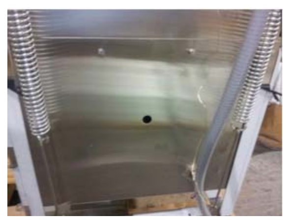
Showing back of tank, 7/8" detergent bulkhead fitting hole

ADS provides two (2) ports, 1/8" IPS female threads in the final rinse mixing chamber for dispenser check valves. Probe hole (7/8") is provided in the wash tank for probe installations (install probe before operating the machine). Detergent hole (7/8") is provided for bulk-head fitting (install fitting before operating machine).