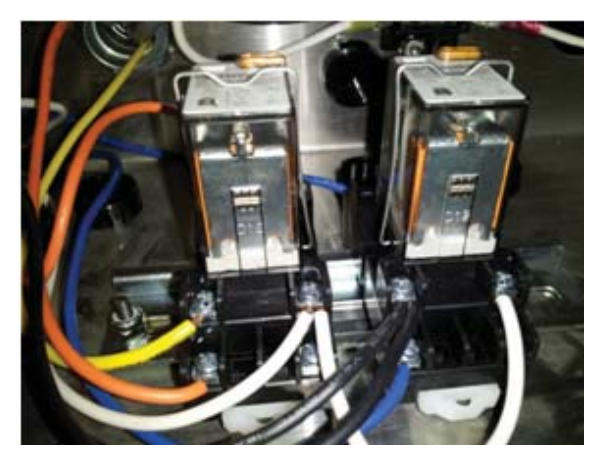
Yellow signal wire from the booster controls heater relay

EXCEPTION—HT-25/34 with booster combo is NOT AVAILABLE in single-phase