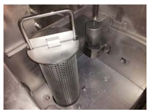
Pump filter in drain sump