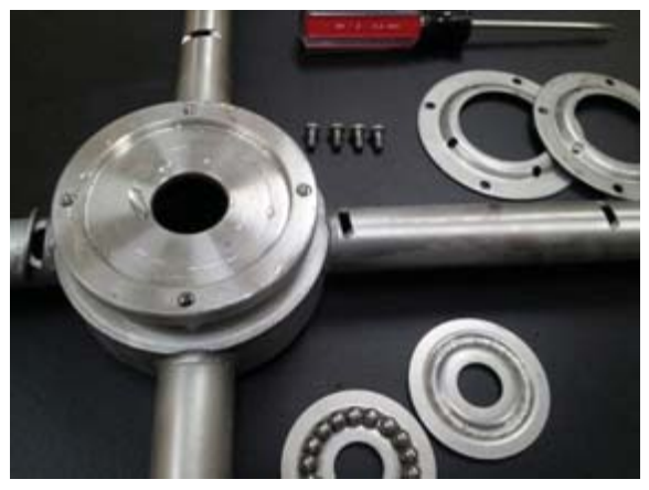
Races are interchangeable, capture shells are also