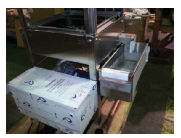
Showing PRV, ASSE approved air-gap, final rinse gauge