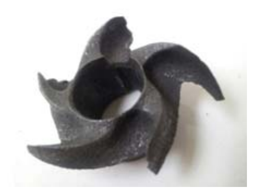
Impeller damaged from high acid solution