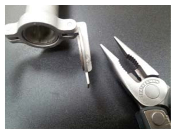
Straighten tab in line with the coin edge to tighten

Tab on endcap bent inward, causing loose fit