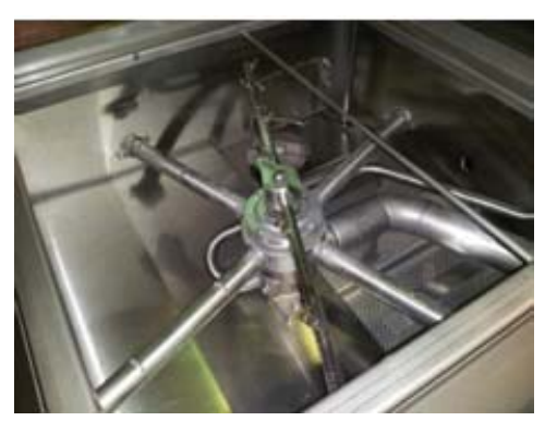
Final rinse arm twisted into transfer tube

Verify incoming water temperatures and final rinse pressure (20 psi during final rinse). Remove any of the white protective film from stainless surfaces such as doors or panels.