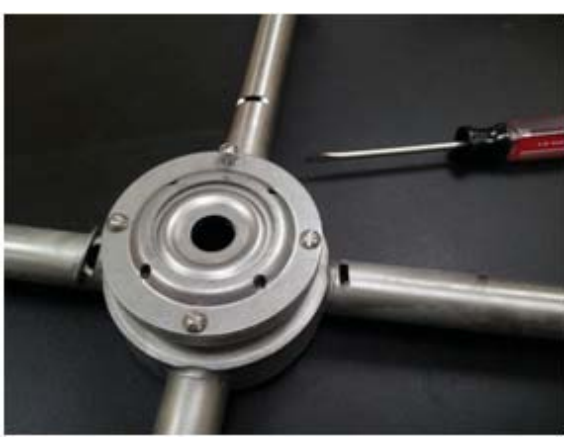
Remove 4 screws and lift top shell