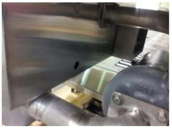
Showing 7/8" detergent probe hole behind pump motor