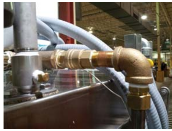
HT hot water inlet ball valve, connected to booster line

BUILT-ON BOOSTER COMBO PLUMBING—Incoming hot water attaches to the lower <sup>3</sup>/<sub>4</sub>"inlet on the booster heater. This should come from the building's hot water heater. The dishmachine and booster come pre-plumbed from the factory and pre-wired. The only connection is the incoming hot water to the booster. A pressure reducing valve with by-pass should be installed before the booster heater if the line pressure is 50 psi or above.