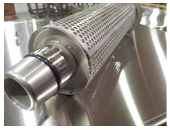
Pump filter and drain plug, note O-ring seal