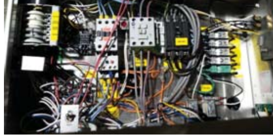
Showing HT-25, 5-wire control box

Before powering up the machine, CHECK ALL ELECTRICAL SCREW TERMINALS in the control box on top of the machine and the heater box. Screws can loosen in transit. Loose connections on high amp load terminals will cause wire burning and component damage during operation and will not be covered under ADS warranty. The term "Clean Circuit" means the electrical circuit breaker supplies no other devices, motors, machines, or lights.