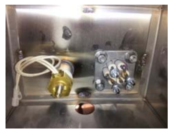
Showing thermostat and sustainer heater terminals*

To operate, connect the breaker for main power and turn "ON" the dishmachine master switch. Water will automatically fill to an operational level. After several cycles when final rinse water increases the tank water level, the tank water will overflow to the scrap box. Place a rack of dishes in the machine, close the door and the cycle will begin.