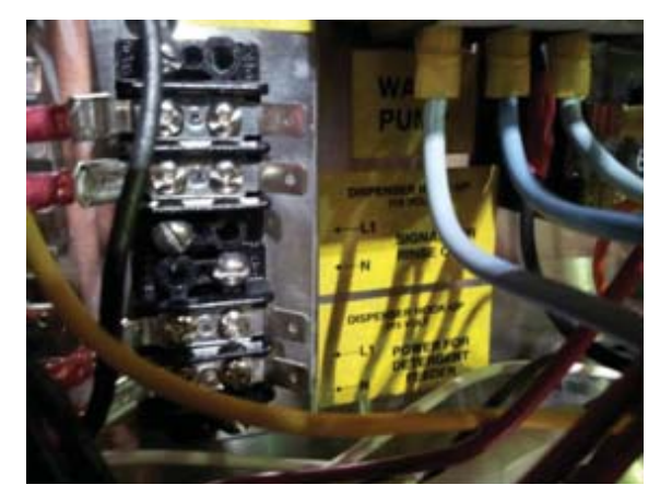
Showing dispenser signal connection terminals

NOTE: Before turning on the water, if the chemical dispenser has not been installed, plug the probe and chemical delivery holes in the wash tank and plug the mixing chamber injection ports.