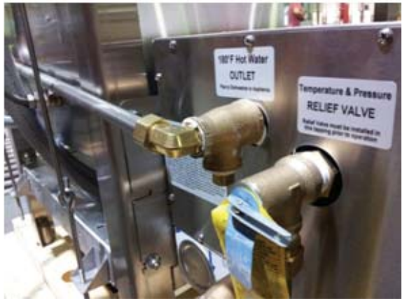
Booster hot outlet line going up to HT-25/34 inlet manifold

For chemical sanitizing the hot water line will come directly from the building's water heater. Connect ½" MPT water supply line to the inlet manifold. The requirement at the dishmachine is 120°F minimum at 20 PSI during final rinse, with a demand of 47.2 GPH. The pressure is measured at the pressure gauge mounted next to the pressure reducing valve in the inlet plumbing on top of the machine's hood. To adjust pressure, turn adjustment screw atop the valve counter-clockwise to decrease pressure. A chemical dispenser must be added that has a third pump for chlorine.