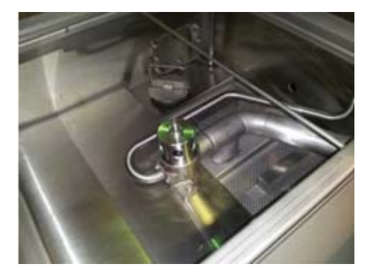
Showing spray arm base & transfer tube Wash arm w/bearing installed on base

Open doors and remove all packaging, including cardboard supports found under the wash tank heater. Do not dispose of packing material until you remove spray arms. Packing materials contain the installation manual, QC check sheets; upper and lower wash and rinse arms. Prior to connecting the main power supply, tighten all wire connections looking for those that loosened during shipping or moving. Before turning on the water, if the chemical dispenser has not been installed, plug the probe and chemical delivery holes in the wash tank and plug the mixing chamber injection ports. Turn on the water supply. Check and correct any leaks throughout the machine. After the first fill and completed cycle, drain the tank then install wash and rinse spray arms, both upper and lower. They are interchangeable top to bottom.