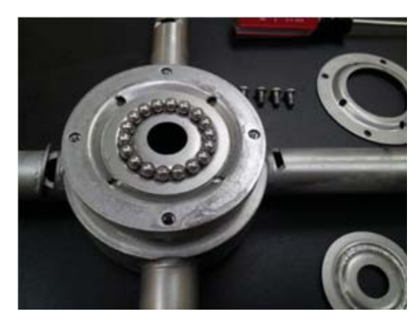
Top race removed, ball bearings for replacement