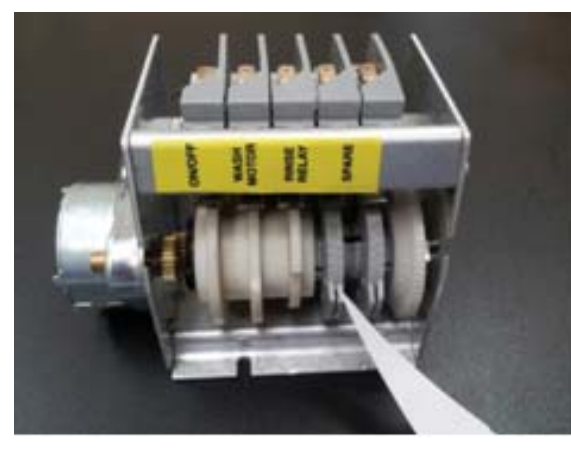
Showing HT-25 cam timer, arrow points to deter cam

Connect to chemical dispenser terminal blocks located on the left-hand side of the control box, look for yellow decal labeled detergent and rinse. The dispenser wash signal comes from the 4th cam on the cam timer. This cam can be adjusted so a signal for detergent can be set for a certain time or limit during the cycle. The rinse signal comes from the 3rd cam, it last for 10 seconds and is not adjustable. The 5th cam is a spare for future features.