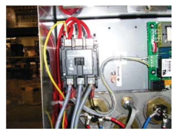
Showing booster contactor, yellow signal wire

BUILT-ON BOOSTER COMBO ELECTRICAL—The combo package uses an inter-latch circuit to turn off the dishmachine sustainer heater anytime the booster turns on. In this feature, there is only one heater circuit energized at a time— allowing both booster and dishmachine to be installed on one 50a service. Connections in the booster heater come from the HT-25/34 control box. The gray 3-phase power wires come from the 50a breaker in the HT-25/34 control box and connect to the incoming side of the booster contactor. The single yellow wire connects to the heater side of the contactor on the L1 terminal circuit. Then the yellow wire connects in the HT-25/34 box to the relay controlling the dishmachine sustainer heater. The dishmachine and booster combination come pre-wired from the factory.