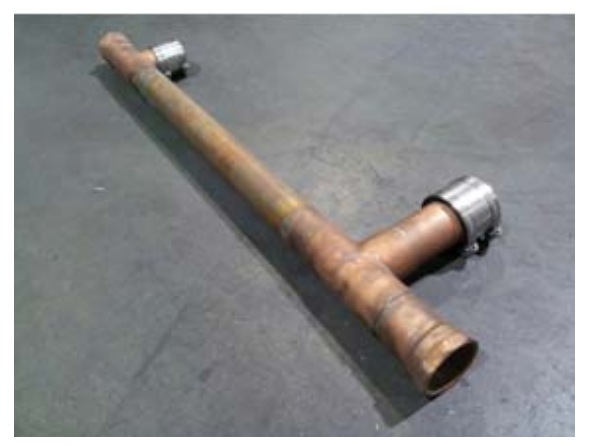
HT-25 drain manifold with "no-hub" connectors